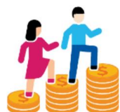
Growing Middle Income Populations