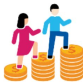
Growing Middle Income Populations