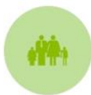
Growing Middle Income Populations