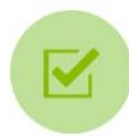
Deepening Comparative Advantages