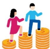
Growing Middle Income Populations